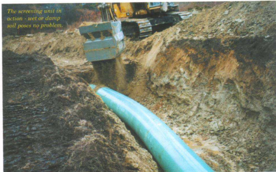
The screening unit in action - wet or damp soil poses no problem.

As a locally made product, MISU has drawn from over 35 years of earthmoving experience - with company directors having been based in the Albury/Wodonga region for that time. MISU also places a high priority on customer service and it is standard company policy to deliver and commission each screening attachment to ensure prop-